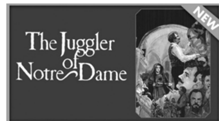
The Juggler of Notre Dame In WATCH: Advent-Christmas

Here are two suggestions – one for the whole family and one for younger children.