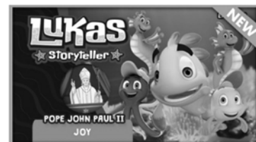
Lukas Storyteller: Pope John Paul II - JOY In WATCH: Youth/Saints

Enjoy these programs and much more for FREE! Visit FORMED.org and create an account. Start by entering the St. Rose Parish Code " c0a592 ", then set up an account using your email address.