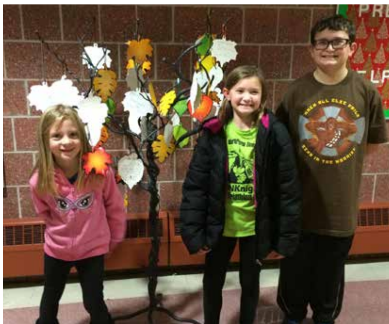
Parish children of all ages enjoyed the annual Thanksgiving Prayer Service & Pizza Dinner. Young members of the Childrens Ministry share a smile in front of the “Tree of Thanks”