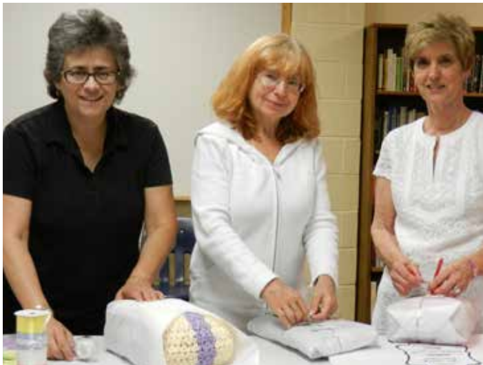
Members of the prayer shawl ministry lovingly wrap shawls for delivery.

In June, we announced formation of a Parish Prayer Shawl Ministry. You may ask, “ What is a prayer shawl ministry? ” People from many faith traditions have found it helpful in their prayer to have ways of recognizing a space as sacred. A prayer shawl is such an aid. The shawl is usually large enough to wrap around one’s shoulders, or even drape over one’s head, and thus “create” a sacred space in which to meditate and pray.