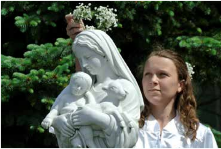
Mater Dei's May Procession...they say a picture, or two, is worth a thousand words...in this case, a thousand "beautiful" words!

of Del Val College visited Mater Dei and offered them advice on the construction of the model.