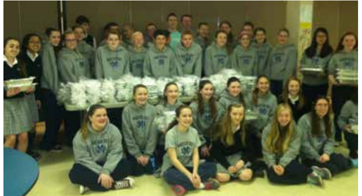
Eighth grade students at Mater Dei prepared hundreds of meals for Aid for Friends in March.

This year, we received donations of about 75 meals per month, up from 60 last year. Major food preparation days, including an all-Parish event in August near St. Rose of Lima's Feast Day, St. Rose Youth Group events, a winter Mater Dei School event, as well as large contributions from the other local churches, resulted in an excess of meals this year. This was helpful when other sites needed meals and when we lost power to the freezer in early May. One of the Youth Group events and the Mater Dei service project focused on making breakfast meals, another of the Aid for Friends initiatives, since we had so many frozen dinner meals at the time. Sharing of meals across organizations is facilitated by a regional coordinator.