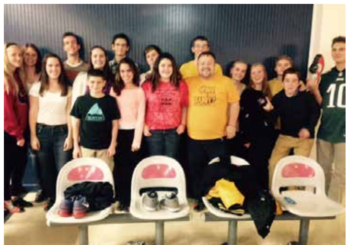
Top: Teens gather for the Year-End Celebration. Middle: The group took a June trip to the Reading Fightin' Phillies; Bottom: A summer bowling outing at the Facenda-Whitaker Lanes.